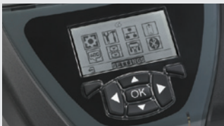
Easy-to-read display with larger, higher-resolution screen