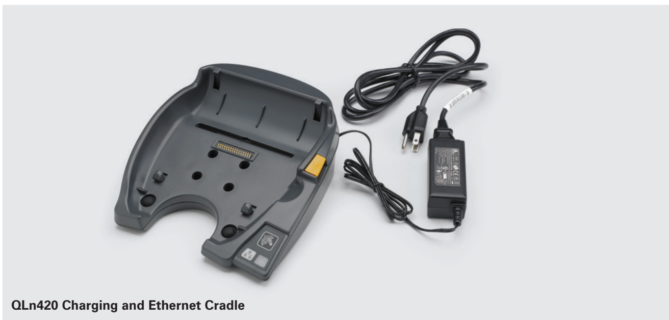
QLn420 Charging and Ethernet Cradle